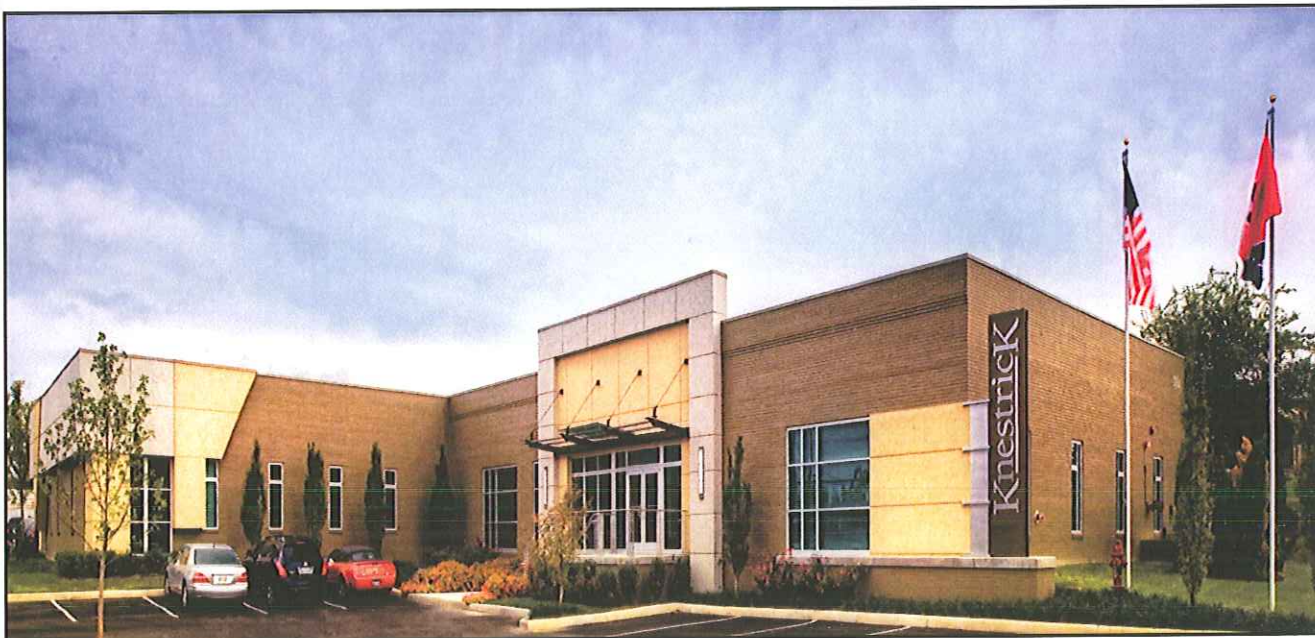
Knestrick Contractor, Inc. New Corporate Office Building

FOR LEASE From 2545 SF to 3479 SF 2964 Sidco Drive Nashville, TN